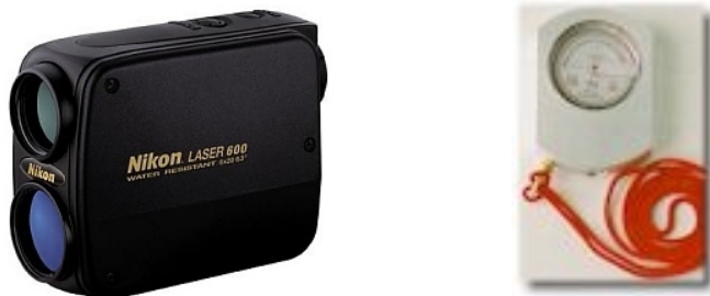
Figure 1. Left: Laser rangefinder. Right: height meter.

Tree height will be measured using a combination of a laser rangefinder and a clinometer. The supplied laser rangefinder (Nikon Laser600, figure 1) takes measurements in yards or in meters, from 10 m to about 100 m, by increments of 0.5 m. (Note 1 yard = 0.9144 m). It is water-resistant, but not water-proof, so don't use it in the rain (you won't see tree tops anyway). The Nikon Laser600 come with one CR2 Lithium battery. Over 6,000 measurements can be achieved with just one battery. Do not throw it away when used. Store the equipment in a dry place overnight and when not used (in silicagel). Please read the notice carefully. The small button, when used together with the large button allows to convert from yard to meters. ALWAYS MAKE MEASUREMENTS IN METERS!! If you really can't figure out how to do it, be very clear that the measurement has been taken in yards on the field spreadsheet.